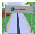
Figure 4: Example of a gantry

Gantry is an overhead assembly on which certain signs or signals are posted. Gantry will not block the road. The design and colour of gantries can be varied.