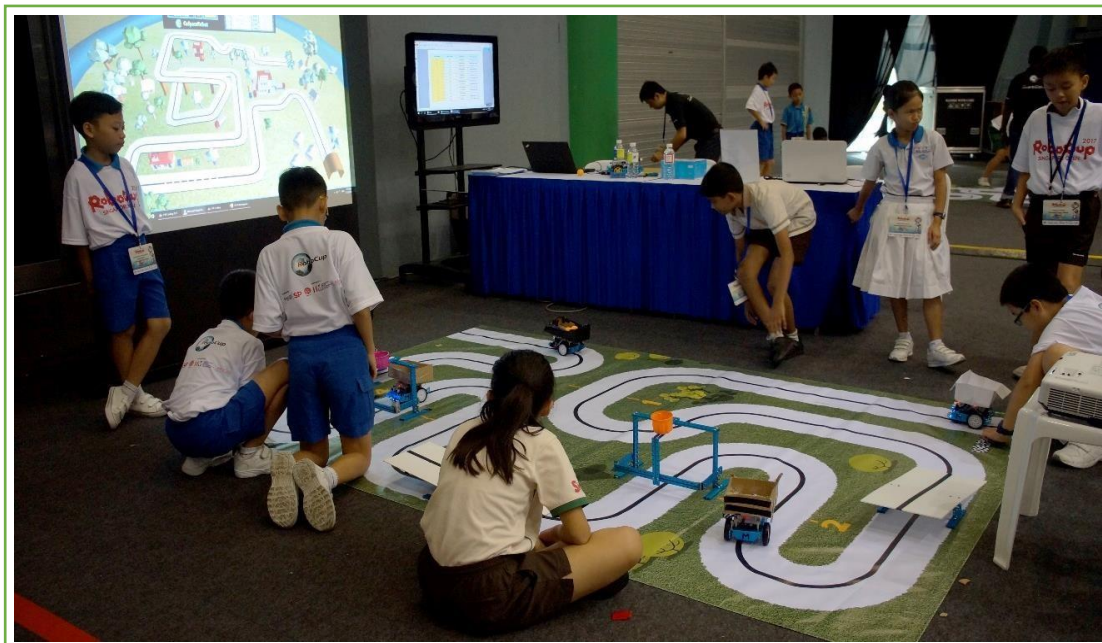
Figure 1: CoSpace Grand Prix Challenge

The CoSpace Grand Prix Simulator is the only official platform for the CoSpace Grand Prix Challenge. This simulator allows programs to be developed using a graphical programming interface (GUI) or C language. The same program for the virtual robot in the virtual environment can be downloaded on to a real robot in the real environment. Participating teams can contact support@cospacerobot.org for CoSpace Grand Prix Simulator download, help and assistance.