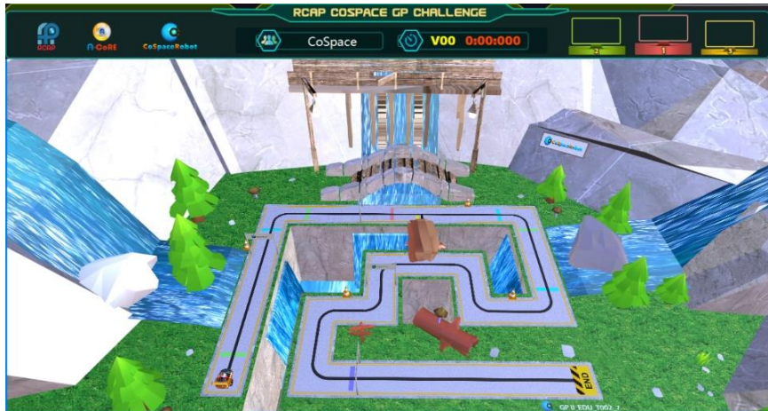
Figure 2: CoSpace Grand Prix Challenge (VRCAP version), U12

Video Link: https://www.youtube.com/watch?v=8gNnGZtgivM